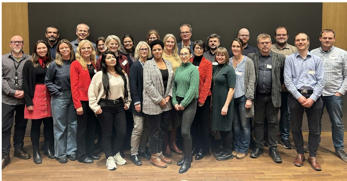
Participants at the impact assessment workshop in December 2025. Digital participants are unfortunately missing.